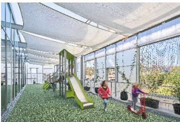
raumwerk.architekten, Hübert & Klußmann PartGmbH, Köln Mixed neighbourhood block, Wuppertal