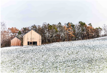
lohrmannarchitekten, Stuttgart Education centre, Weil der Stadt