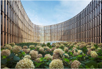
Christoph Ingenhoven Architects, Düsseldorf; ingenhoven associates GmbH, Düsseldorf Town Hall, Freiburg im Breisgau

Press images - free of charge for one-off, purely editorial use in the direct context and for the duration of the ARCHITECTURE AND ENERGY exhibition, provided the author is named.